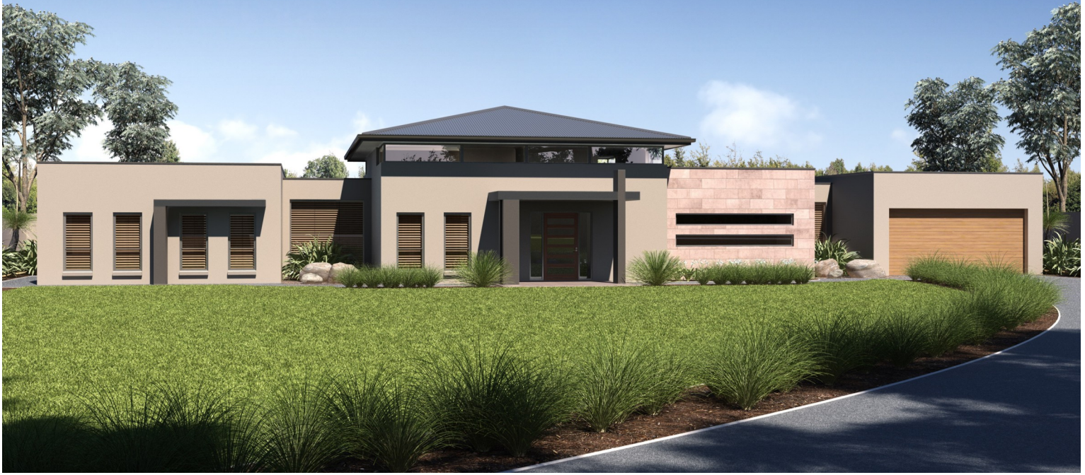
Optional Facade Shown